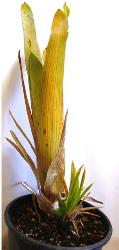
Brocchinia reducta grown by Mitch Jones

It has been argued that Brocchinia reducta is not actually carnivorous because the production of digestive enzymes could not be found. However, in 2005 it was shown that the plant produces at least phosphatase enzymes in its glandular structures and is thus considered a true carnivorous plant. The enzymes and bacteria digest the trapped insects and thus release the nutrients for absorption by the leaves.